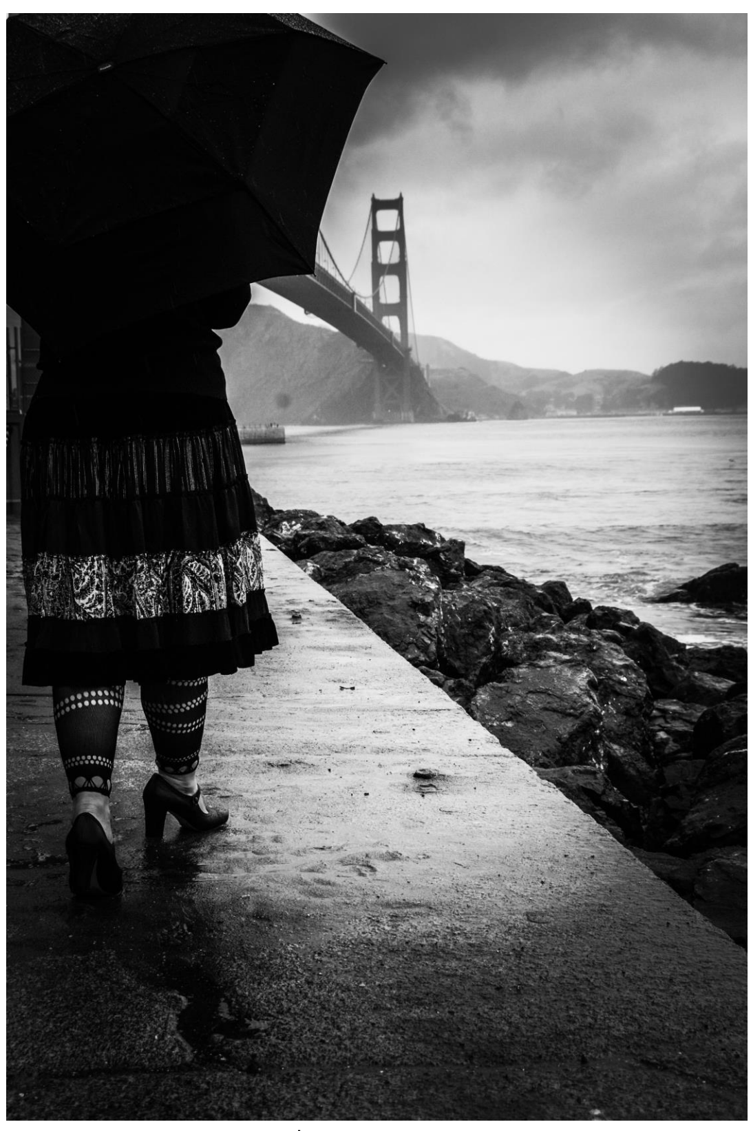
A Day In My Shoes San Francisco