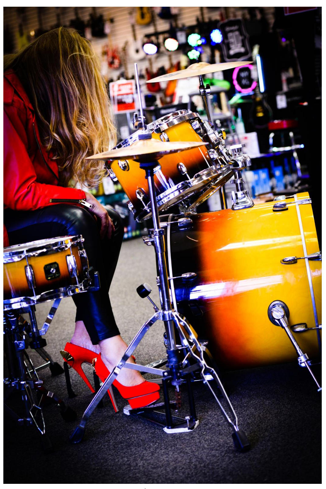
A Day In My Shoes Sarasota